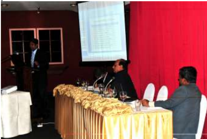
Chapter President and Vice President at the PMI CC AGM discussing the roles and responsibilities of the volunteer leaders.